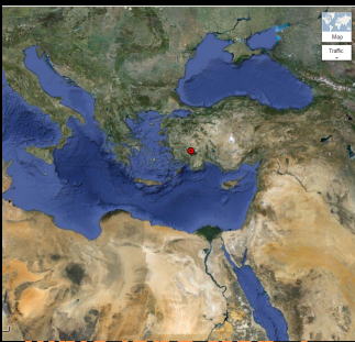
Bible land Map 2