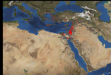
Bible lands Map