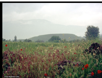
'Tell' of Colossae